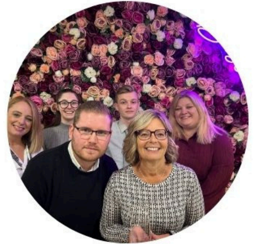
Income Management Team One Team