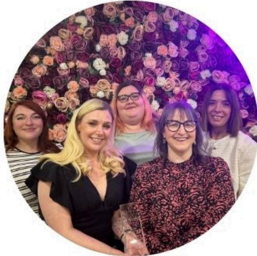
Complex Communication & Autism Team Inclusive